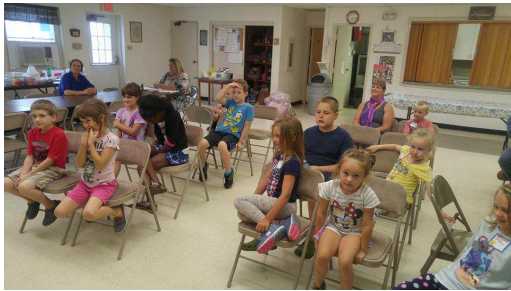
Our mini church

Our theme this year was God's Big Top . This was a continuation of the joy we shared on Children's Sunday.