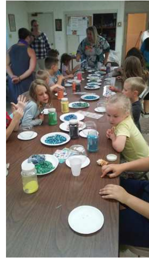
Fish bowl craft

Who did, who did, who did, who did, who did swallow Jonah?